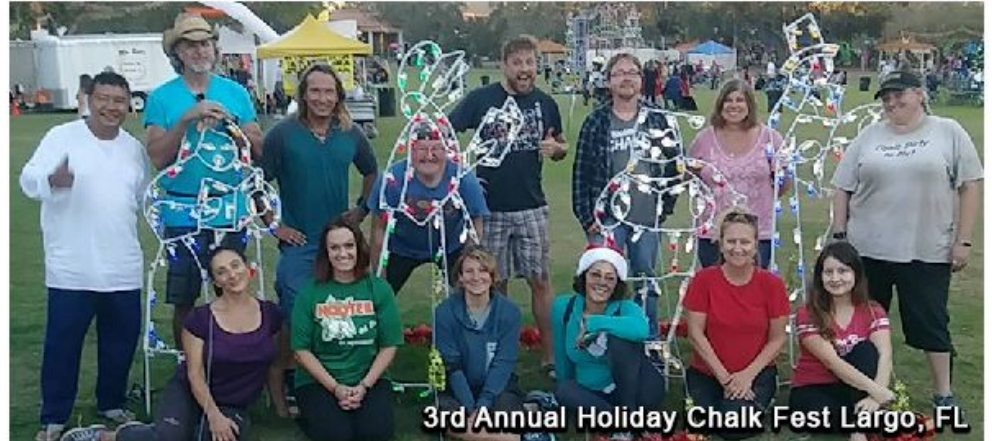
3rd Annual Holiday Chalk Fest Largo, FL