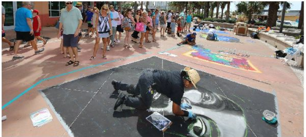
Clearwater Beach Chalk Art Festival, 2017

Remember, if you show RESPECT you will receive RESPECT!